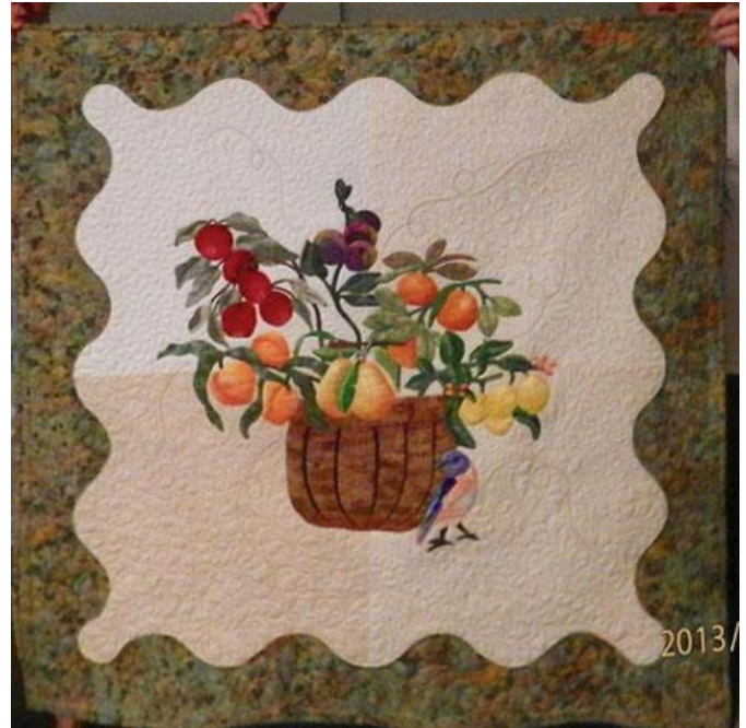
Show & Tell of the Month by The Applique Society Friendship Group