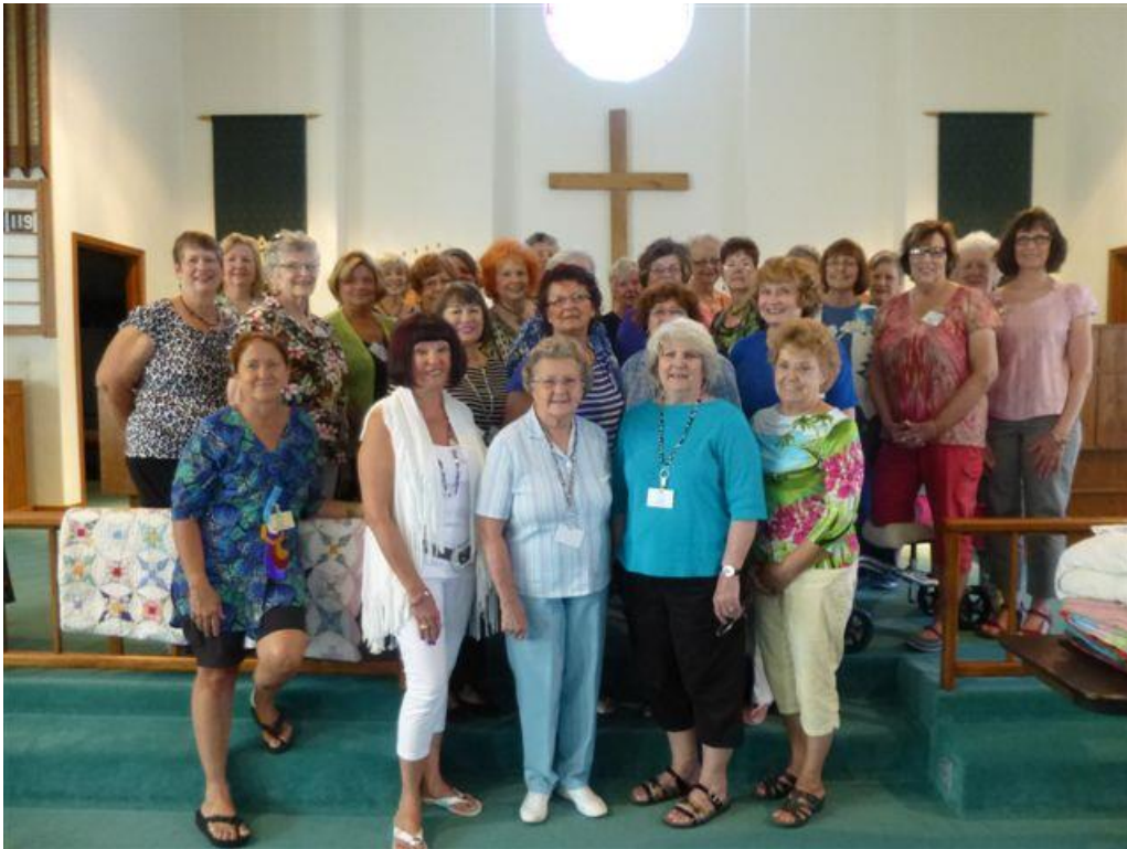
These are the ladies that will be running the Guild for the 2015-2016 Year. Thank you, Ladies!